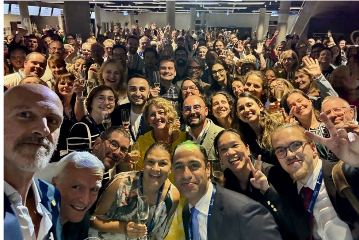
SESAM Speed Connect - Prague

To benefit from year-round opportunities including access to Mentoring, educational events, reduced processing fee on Advances in Simulation and lots more, please consider joining SESAM as a member. See more details here .